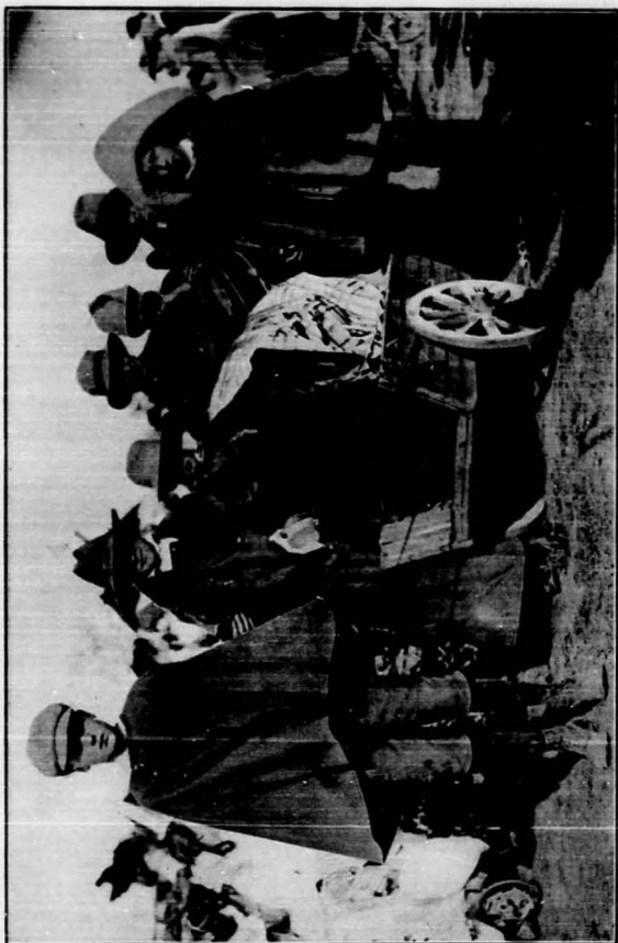
Washington Playground Association, Washington, D. C. A FOURTH OF JULY CELEBRATION, WASHINGTON, D. C.