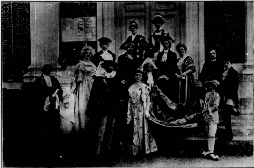
University of Virginia, Charlottesville, Va.