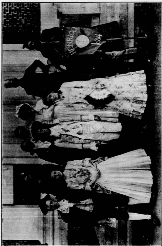
University of Virginia, Charlottesville, Va.

A FOURTH OF JULY CELEBRATION. HENRICO COUNTY, VIRGINIA.